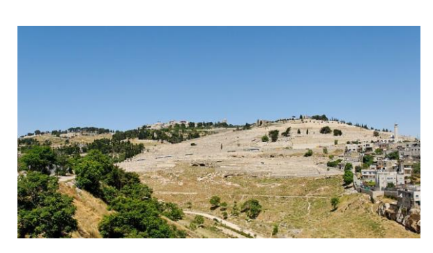
Mount of Olives

of a ridge of mountains that includes the Mount of Olives . Mt. Scopus is one of the best areas offering an amazing view of Jerusalem. Mount of Olives is named for the olive groves that once covered the slopes, famous for being the place where many key events in the life of Jesus took place.