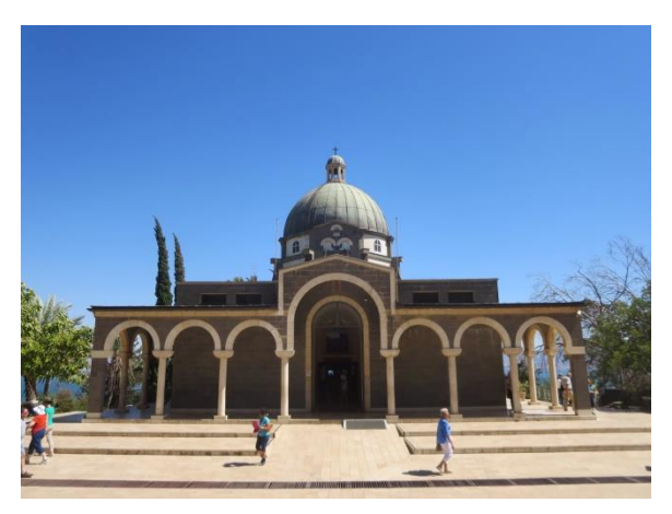
The Mount of Beatitudes

The Mount of Beatitudes is a famous site where the Sermon on the Mount was believed to be conducted by Jesus, his most famous discourse, considered to be one of the most beautiful and serene places for religious followers. Enjoy incredible views overlooking the northwestern shore of the Sea of Galilee and the Golan Heights.