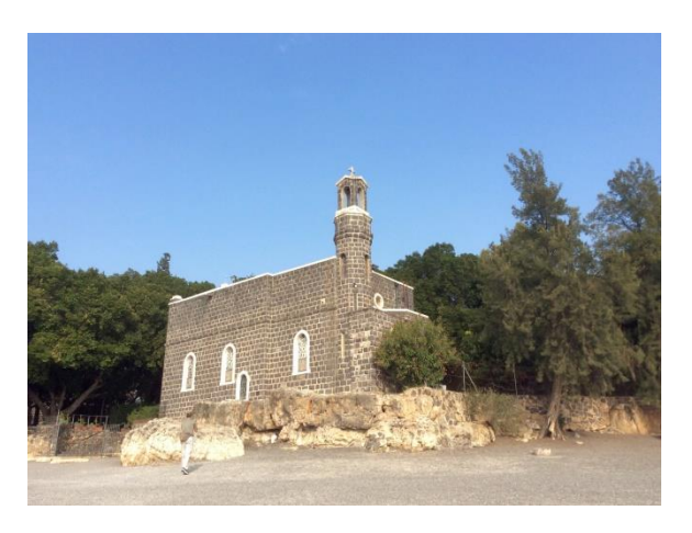
Church of Multiplication

Your Guide shall lead you to Capernaum , the house of Peter and an incredible Roman synagogue from ancient times, there is also a Greek Orthodox Church near the Catholic compound.