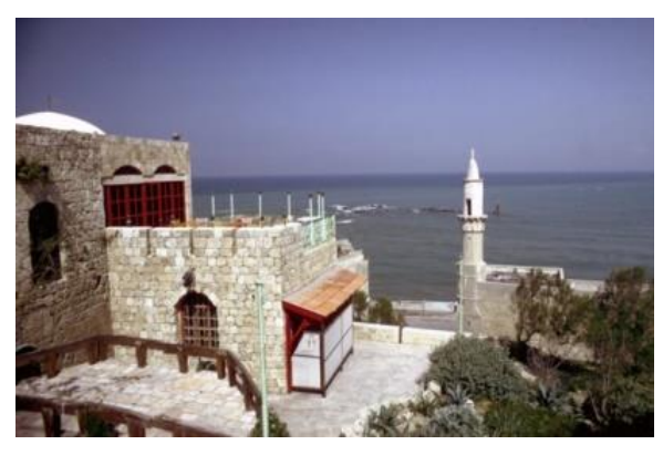
House of Simon the Tanner

Depart Hong Kong (HKG) by CX675 0110hrs, arrive 0755hrs (approx. flying time 11hrs 45mins), meet and greet, transfer to Jaffa.