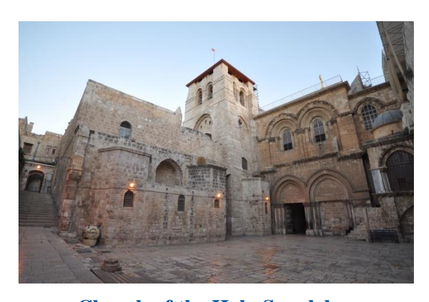
Church of the Holy Sepulchre

Just outside the city you will find Mount Zion after which your final point of interest